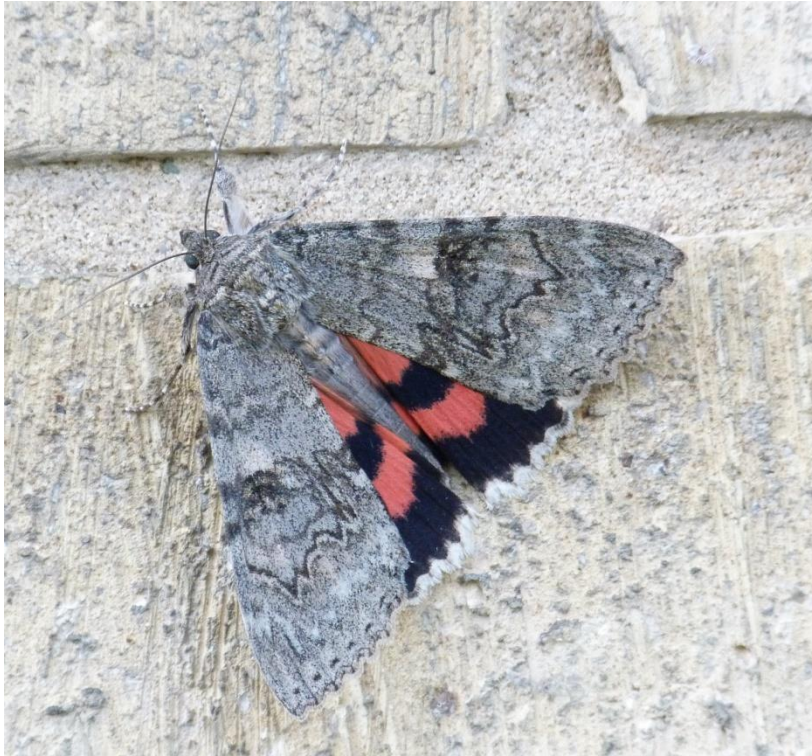
Red Underwing Catocala nupta