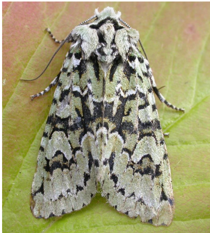
Merveille du Jour Griposia aprilina

In this report information presented relates in the first part to records for weeks 28 to 36 (Q4) and in the second part for the whole 36 weeks of the scheme.