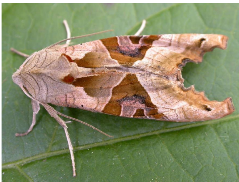
Angle Shades Phlogophora meticulosa