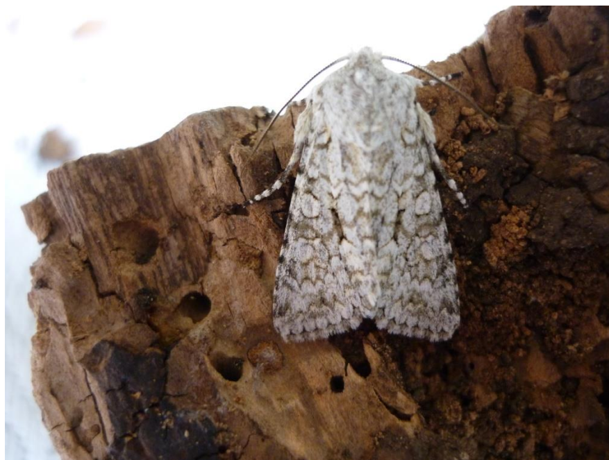
Grey Chi Antitype chi Graham Birkett

A full list of species and numbers recorded is attached in Appendix 1.