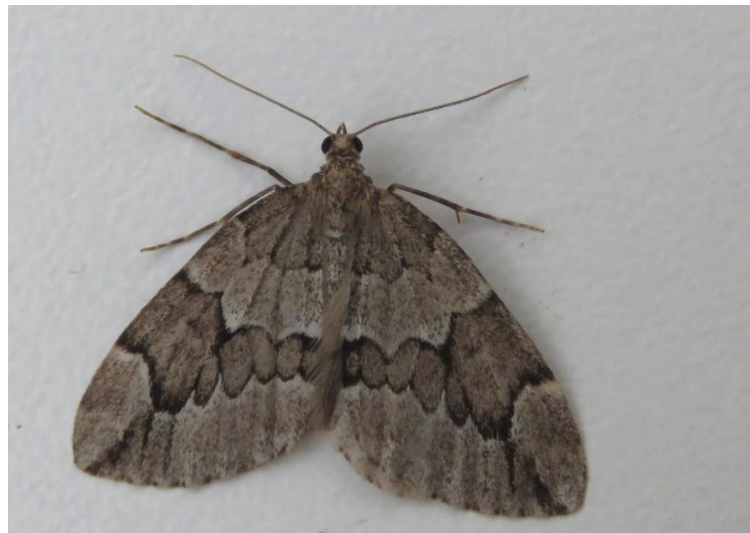
Juniper Carpet Thera juniperata