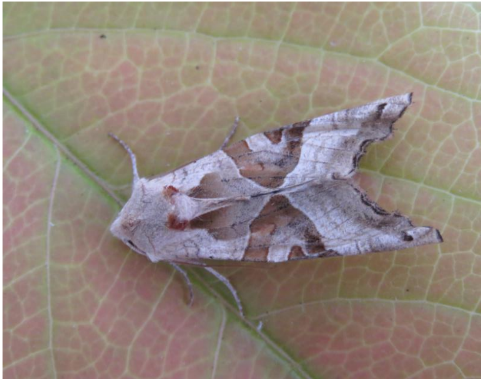
Angle Shades Phlogophora meticulosa