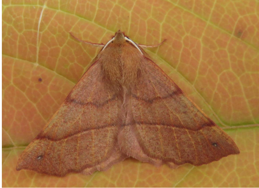
Feathered Thorn Colotois pennaria