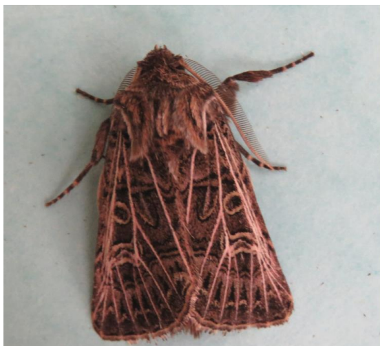
Feathered Gothic Tholera decimalis Simon Roddis

On reviewing Table 2 it appears that the recording rates for most species for this quarter are again down compared to 2015 and previous years. The recording of Dark Arches for this quarter is at an all-time low as it is Common Rustic agg. On the positive side does appear to have been a good year for Light Brown Apple Moth unless you are an apple grower! This is possibly a reflection on the relatively mild winter of 2015/16 improving its survival rate.