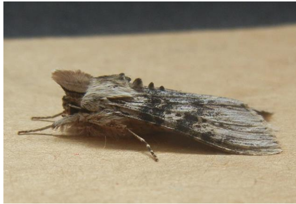
Wormwood Cucullia absinthii