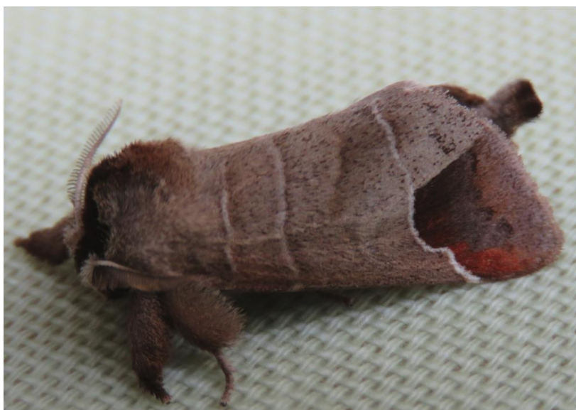
Chocolate-tip Clostera curtula