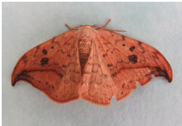
Pebble Hook-tip Drepana falcataria Simon Roddis

The general feeling of recorders seems to be that the number of moths being recorded picked up a during weeks 19 to 27 following the general slow start during weeks 1 to 18 but still generally down on previous years particularly when directly compared to 2015.